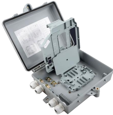
Outdoor Pole Mount Termination Box (A1600T-DPB-02)

A1600T Waterproof Fiber Optic Enclosure is suitable for fiber optic access network in the wiring cable and home leather cable junction point, can adapt to the user's different installation environments (such as wall-mounted installation, holding pole installation, placed on the workbench), is a sealed, waterproof, dustproof, portable mini-encapsulated box. The splitter box can be built-in cassette, which can realize the compact installation of the cassette.