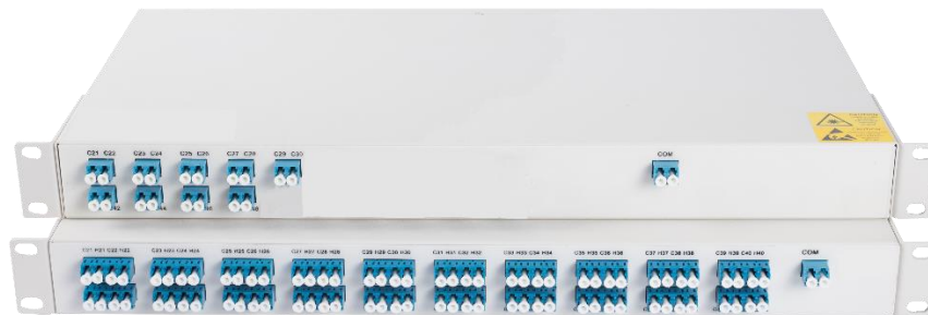
Rack-Mounted OADM/ODM Equipment