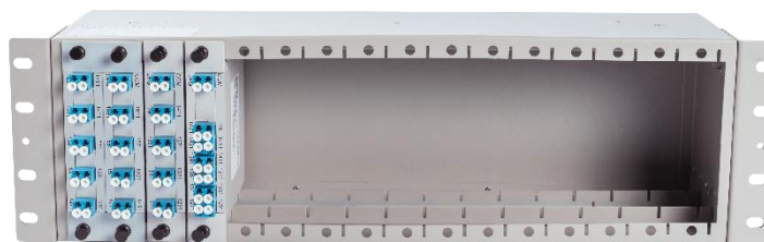
3U transmission platform (A1600P-CHAS-3U)